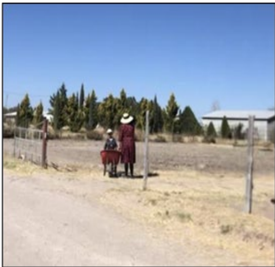
Figure 9: Two LGS Mennonite children in a colony in Mexico.

LGS Mennonites are often impacted by the many cultural differences that exist in Ontario compared to life in colonies in Mexico, Central or South America. Colonies are much more homogenous—most people share similar beliefs, values, and cultural background, even when a diversity of churches or traditions is present. In Ontario, LGS Mennonites settle in established communities with a diversity of people, who have a variety of beliefs, values, and cultural backgrounds. At the same time, LGS Mennonite newcomers encounter dominant Canadian norms and values that may differ, or even conflict, with their own. (For example, Canada tends to be an individualistic society, where the needs and wants of an individual are valued over the needs and wants of the group).