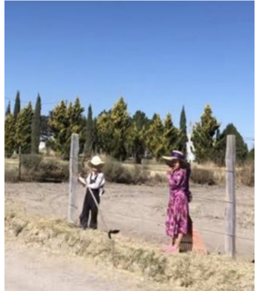
Figure 1: Two Low German Speaking Mennonite children in Mexico. This is an example of clothing worn by many LGS Mennonites.

Low German Speaking (LGS) Mennonites have been settling in southwestern Ontario since the late 1950s, in areas including Essex, Chatham-Kent, Elgin, Oxford, Norfolk, and Niagara. Many are identifiable by their distinctive dress, specific surnames, and Low German (Plautdietsch) language. LGS Mennonite is a broad classification created to refer to a group of Mennonites with a common language and shared migration history. They are considered an ethnoreligious group—a group that shares both a common religious and ethnic origin. Due to their particular history and culture, LGS Mennonites often require specific considerations and accommodations when accessing community services like education, healthcare, or social services.